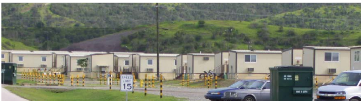
An estimated 580 troops live in containerized housing units manufactured in 2006 and 2008. All units have exceeded their economic life of five to seven years. Common problems with the units are roof leaks, plumbing failures and mold growth.

Our no-fail mission: detention operations. Although most of our efforts are focused on engaging with our partners in Latin America, we also continue the safe, humane, legal, and transparent care and custody of the remaining detainees at JTF-GTMO. As many members of Congress have witnessed firsthand, the medical and guard force at JTF-GTMO are not merely caring for these detainees; they are providing the best of care . Our troops in close contact with detainees face periodic assaults and threats to them and their families, yet they remain steadfast in their principled care and custody role. Every day they demonstrate the same discipline, professionalism, and integrity as they confront the same dangerous adversaries as our men and women fighting in Afghanistan, Iraq, and elsewhere around the world. I know this Committee, our Secretary of Defense, and our President applaud their commitment and share my pride in