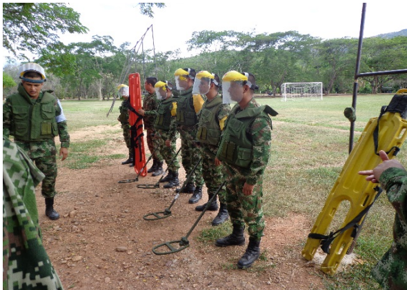
A Colombian demining team conducting demining drills.

Enabling partner nations. While our capacity building efforts help partner nations address immediate threats, over time we seek to encourage a network of capable partners who contribute to international security and advance shared principles like good governance and human rights. Chile is a regular participant in USPACOM's annual RIMPAC exercise and will assume a greater exercise leadership role in the future. Colombia is leading an effort to integrate a block of Pacific Alliance nations into the Western Pacific Naval Symposium, and is expanding defense cooperation with South Korea, Japan, and potentially Vietnam. Colombia has entered into a partnership agreement with NATO, and we are working closely together on deepening this cooperation. Brazil is deepening its maritime security cooperation with West Africa, focusing on countering illicit trade between the South American and African continents. Many nations in the hemisphere have joined many other regional leaders in supporting UN peacekeeping operations around the world, including the UN mission in Haiti. Through the Global Peace Operations Initiative (GPOI), we have helped sustain critical partner capabilities for Guatemala and Uruguay peacekeepers in the Democratic Republic of Congo and Haiti; helped El Salvador deploy helicopters to the UN mission in Mali; and supported Peruvian airfield engineers to the Central African Republic.