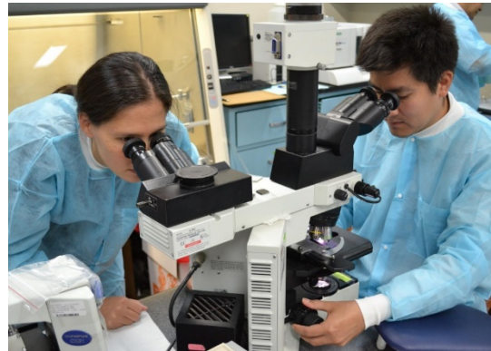
The U.S. Naval Medical Research Unit 6, located in Lima, Peru, prevents, detects and responds to disease outbreaks, in particular, mosquito-borne illness to include Zika, dengue fever and chikungunya.

Regionally, our health and medical readiness engagements build partner nation capacity—including infrastructure, equipment, and skilled personnel—to prevent, detect, and respond to disease outbreaks. At the early stages of the Zika outbreak, the U.S. Naval Medical Research Unit 6 (NAMRU-6), based in Peru, established research sites in partnership with Colombia, Guatemala, Honduras,