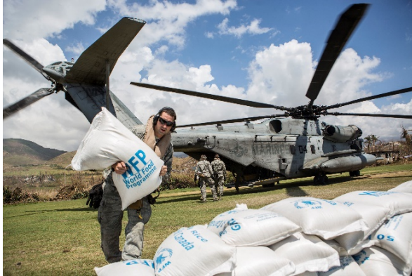
U.S. service members from Joint Task Force Matthew offload bags of food from the World Food Programme onto a pallet in preparation for delivery to the areas affected by Hurricane Matthew in Port-au-Prince, Haiti, Oct. 12, 2016. By the end of their mission, Joint Task Force Matthew delivered 275 metric tons of supplies and conducted 98 missions in support of USAID/OFDA and the Government of Haiti.

Additionally, the immediate deployment of elements from U.S. Transportation Command's (USTRANSCOM) Joint Enabling Capabilities Command (JECC) was absolutely critical to our effective response. U.S.-based forces deployed aboard the USS MESA VERDE and USS IWO JIMA also provided robust relief from the sea. During the relief mission, we also coordinated with our U.S. Coast Guard (USCG) partners to deter potential migration in the aftermath of the hurricane and supported the Department of State's outreach to regional partners seeking to contribute to the response effort.