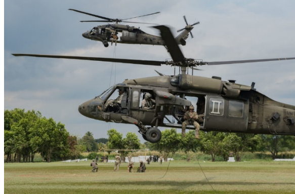
A pair of UH-60 Blackhawk helicopters assigned to Joint Task Force-Bravo's 1st Battalion 228th Aviation Regiment provide aviation support during Operation Serpiente, a joint air assault training mission led by members of the U.S. 7th Special Forces Group and Naval Special Warfare, Dec. 2, 2016 at Ilopango Airport, El Salvador.

while ensuring the layered defense of the U.S. homeland. Central American partners are increasingly capable, playing a significant role in almost a quarter of JIATF South's maritime interdiction operations and conducting operations on their own, and with one another.