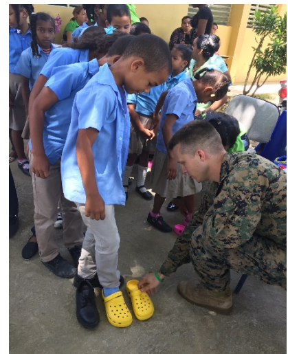
USSOUTHCOM coordinated the donation of 600 pairs of shoes from the Shuzz Fund during the 2016 NEW HORIZONS exercise.

treated nearly 30,000 patients, conducted 242 surgeries, and constructed schools and clinics in remote areas. Similarly, our training missions like JTF-Bravo's medical engagements and CONTINUING PROMISE bring together U.S. military personnel, partner nation forces and civilian volunteers to treat tens of thousands of the region's citizens. We are also building basic infrastructure like schools, medical clinics, and emergency operations centers and warehouses for relief supplies. These activities provide training opportunities for our own personnel, while also improving the ability of our partners to provide essential services to their citizens and meet